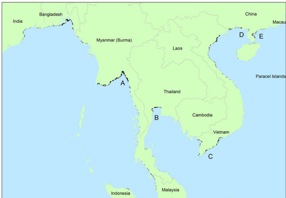
Figure 2. Modelled potential distribution of Spoon-billed Sandpiper habitat. Map shows the 5% of the study area with the highest predicted likelihood of occupancy. The predicted distribution of the Spoon-billed Sandpiper on which Figure 2 is based is available as a .tif for GIS in Figure S2. A indicates Gulf of Mottama, Myanmar, B is Inner Gulf of Thailand, C is south Mekong delta, D is Guangxi and E indicates Guangdong.

The species is widely distributed in winter over an area stretching from Bangladesh to Eastern China just south of the Yangtze River estuary. The majority of birds seem to winter in Myanmar, where 60% of the population has been observed. At least 80% of the entire global population appears to winter in Myanmar and Bangladesh. Surveys of wintering Spoon-billed Sandpipers were undertaken at sites in six of the flyway countries over a nine-year period. Collating records of these birds allows us to build up a database of areas used by wintering individuals, pointing to areas of conservation priority for the species. Difficulties in standardisation of