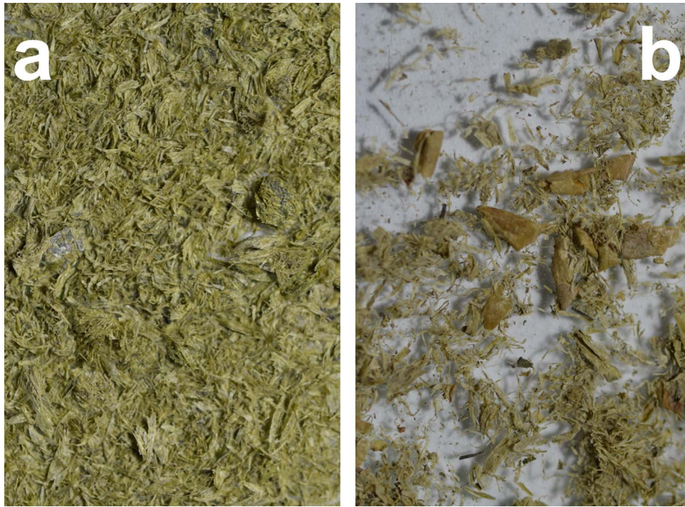
Fig. 3. Plant material observed in the geese faeces: remains of leaves (a) and seeds (b).

high lead shot densities in the wetlands (Figuerola et al., 2005). Geese are usually less prone to ingest lead shot than ducks, for several reasons. Firstly, they typically feed in grasslands or crops where lead shot density tends to be lower than in wetlands. Secondly, their mainly herbivorous diet makes the ingestion of lead shot mistaken as food items less likely than for granivorous ducks (Thomas et al., 1977). Thirdly, grit particles can readily be picked-up by geese from the surface of farmland areas (i.e. on paths or roadsides), where these particles tend to be abundant and the risk of confusion with lead shot is minimal (Mateo and Guitart, 2000). On the other hand, the lakes studied in Bulgaria have a depth of more than 50 cm over most of their surface, so the only areas where geese could pick-up lead shot are the shallow waters close to the shoreline. This shallow area is where we sampled to determine the lead shot density, since we had similar limitations to geese in accessing the lake bottom. The maximum lead shot