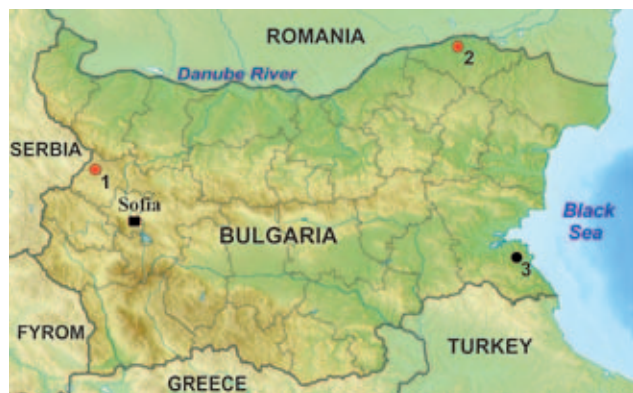
Fig. 1. Map of present (red circle) and past (black circle) distribution of A. vesiculosa in Bulgaria: 1) Dragomansko swamp; 2) Lake Srebana; 3) Lake Arkutino.