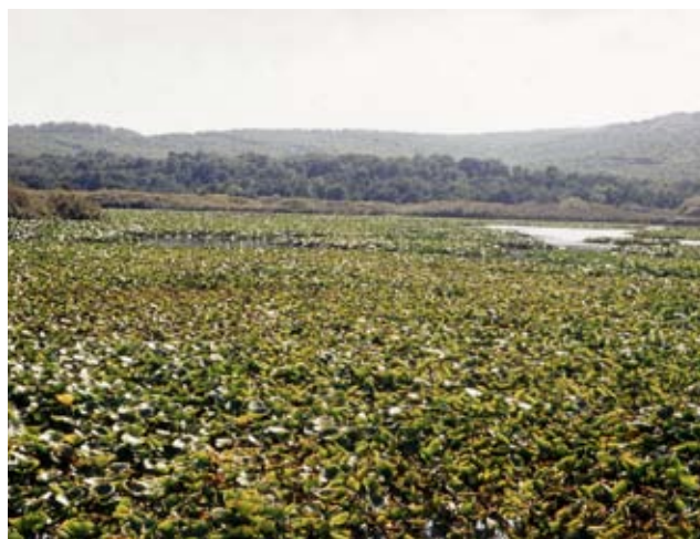
Fig. 2. Lake Arkutino and open water with N. alba . In the background the reed zone and the longoz (flooded) forest communities.

sils (seeds, fruits or fruitstones) as explained in Bozilova & Beug (1992). Photos of fossil A. vesiculosa seeds were taken with a special microscope for macro objects. The radiocarbon dates from sediment core Arkutino-2 closest to the A. vesiculosa seeds were calibrated to calendar years ( \pm 2\sigma range, mean value) with the computer program OxCal v4.3 (Bronk Ramsey 2009) using the relevant atmospheric data (Reimer & al. 2013). The calibrated ages in BC/AD are shown on Table 1.