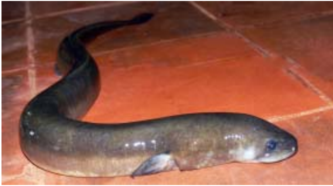
Image 1. Indian Shortfin Eel Anguilla bicolor