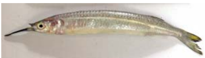
Image 20. Halfbeak Gar or Congaturi Halfbeak Hyporhamphus limbatus