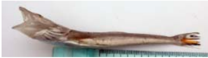
Image 24. Bar-tailed Flathead Platycephalus indicus