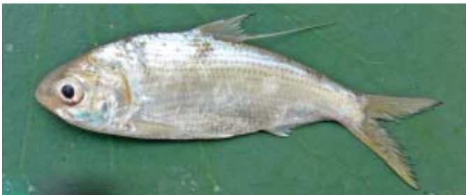
Image 4. Bloch's Gizzard Shad Nematalosa nasus