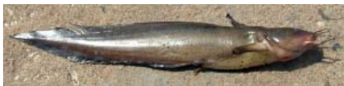
Image 16. Gray Eel Catfish Plotosus canius