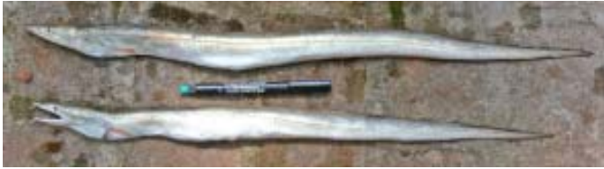
Image 2. Indian Pike conger Congresox talabon