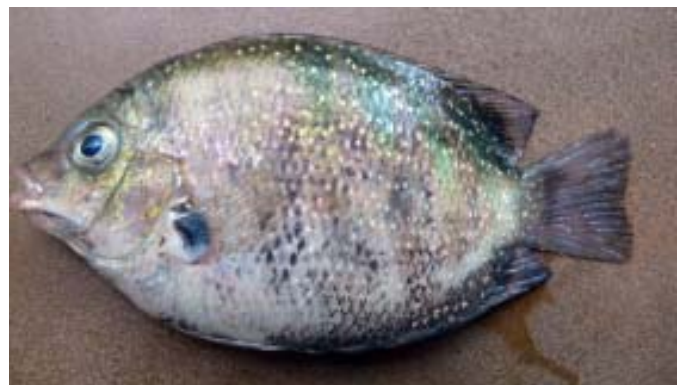
Image 33. Pearl Spot Etroplus suratensis