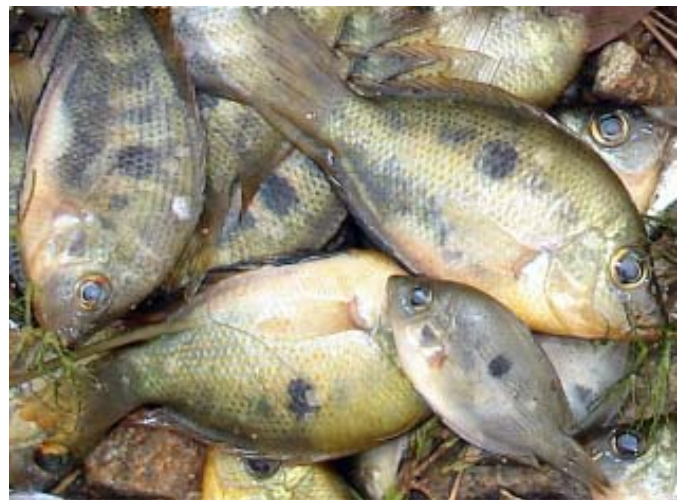
Image 32. Spotted Etroplus Etroplus maculatus