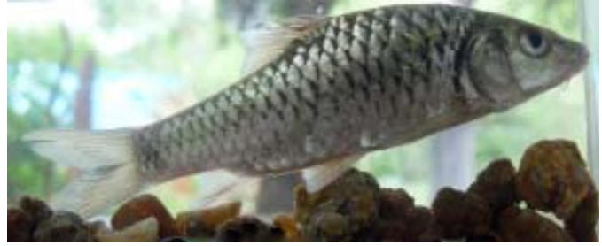
Image 6. Kaveri Barb Puntius dorsalis