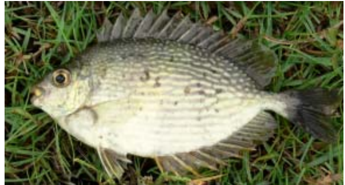
Image 31. Streaked Spinefoot Siganus javus