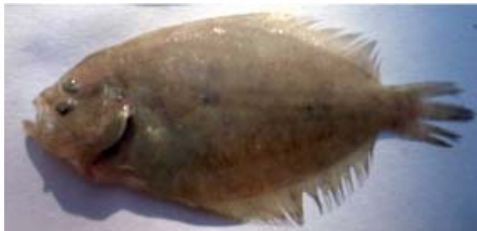
Image 41. Tongue Sole or Flounder Pseudorhombus arsius