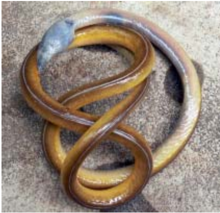
Image 3. Indian Longtailed Sand Eel Bascanchthys deraniyagalai