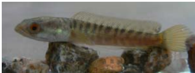
Image 40. Striped Snakehead Channa striatus