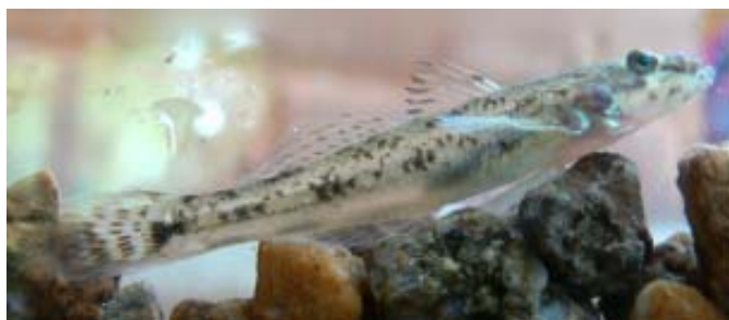
Image 37. Tank Goby Glossogobius giurus