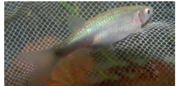
Image 11. Flying Barb Esomus thermoicos