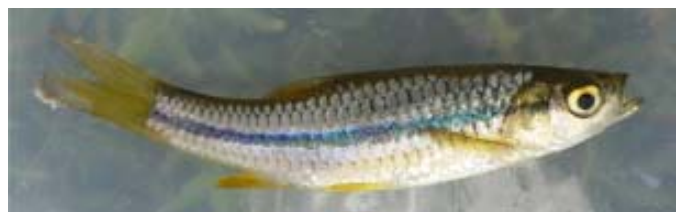
Image 10. Blackline Rasbora Parlucciosoma daniconius