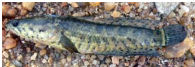
Image 39. Spotted Snakehead Channa punctatus