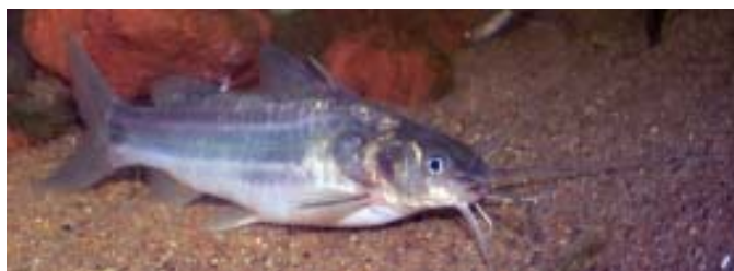
Image 14. Striped Dwarf Catfish Mystus vittatus