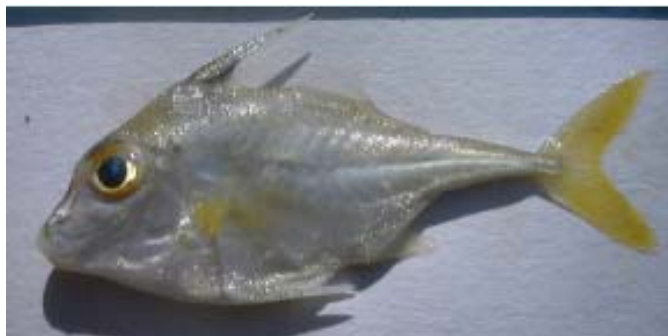
Image 44. Tripod Fish Triacanthus brevirostris