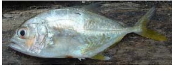
Image 30. Malabar Trevally Caranx malabaricus