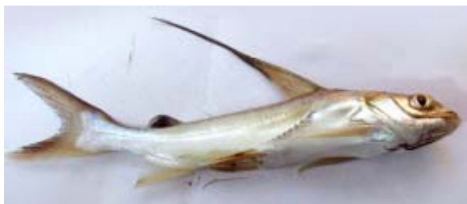
Image 15. Shovelnose Marine Catfish Arius subrostratus