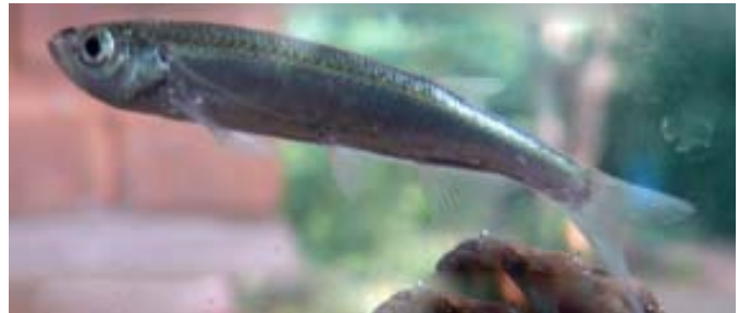
Image 9. Bloch's Razorbelly Minnow Salmostoma clupeoides