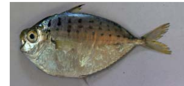
Image 29. Deep Pugnose Ponyfish Secutor ruconius