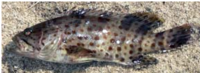
Image 26. Greasy Grouper Epinephelus tauvina