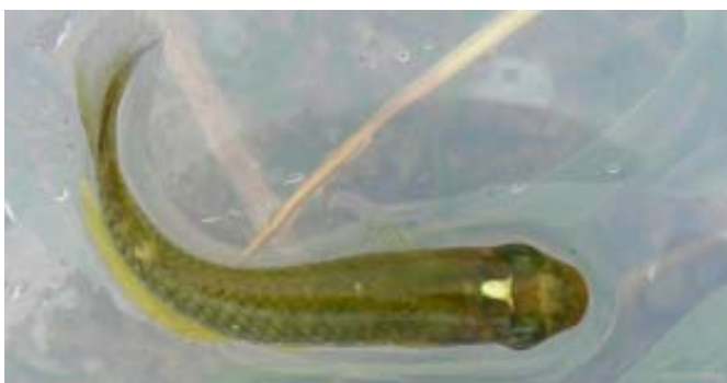
Image 21. Dwarf Panchax Aplocheilichthys parvus