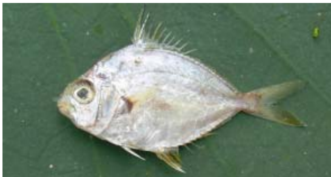
Image 28. Splendid Ponyfish Leiognathus splendens