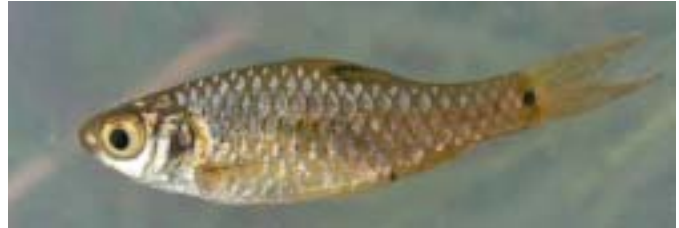
Image 7. Greenstripe Barb Puntius vittatus