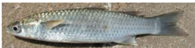
Image 17. Common or Flathead Mullet Mugil cephalus