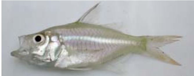
Image 25. Glassy Perchlet Ambassis commersoni