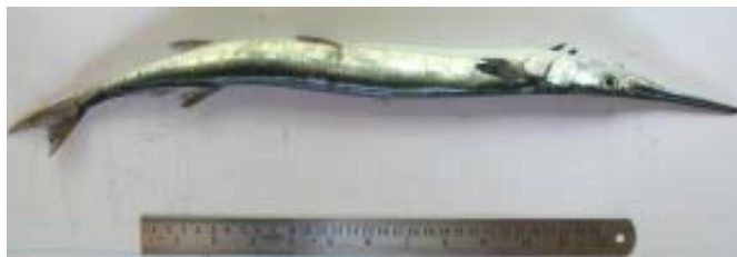
Image 18. Freshwater Garfish Xenentodon cancila