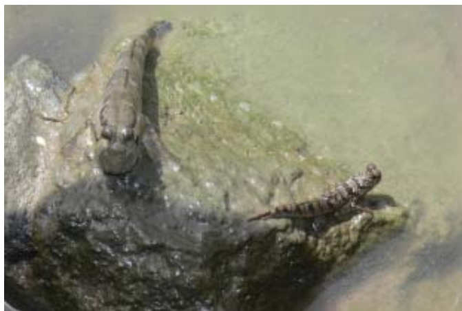
Images 35 & 36. Mudskipper Boleophthalmus boddarti & Periophthalmus sp.