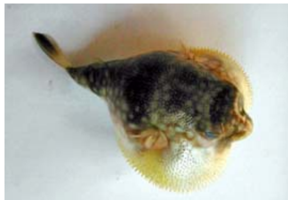
Image 42. Puffer Tetrodon fluviatilis