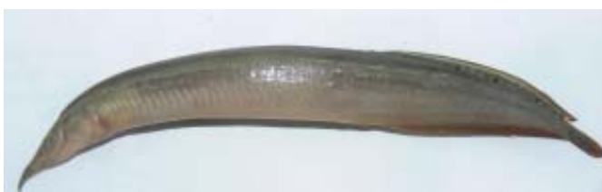
Image 23. Onestripe Spiny Eel Macrogathus arai