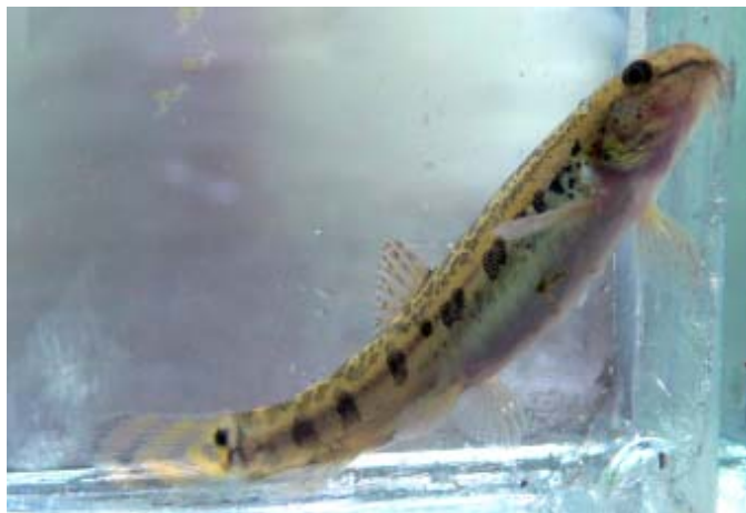
Image 12. Malabar Loach Lepidocephalus thermalis