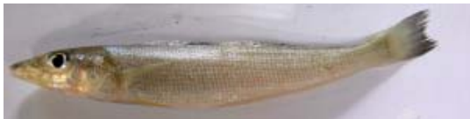
Image 27. Silver Sillago Sillago sihama