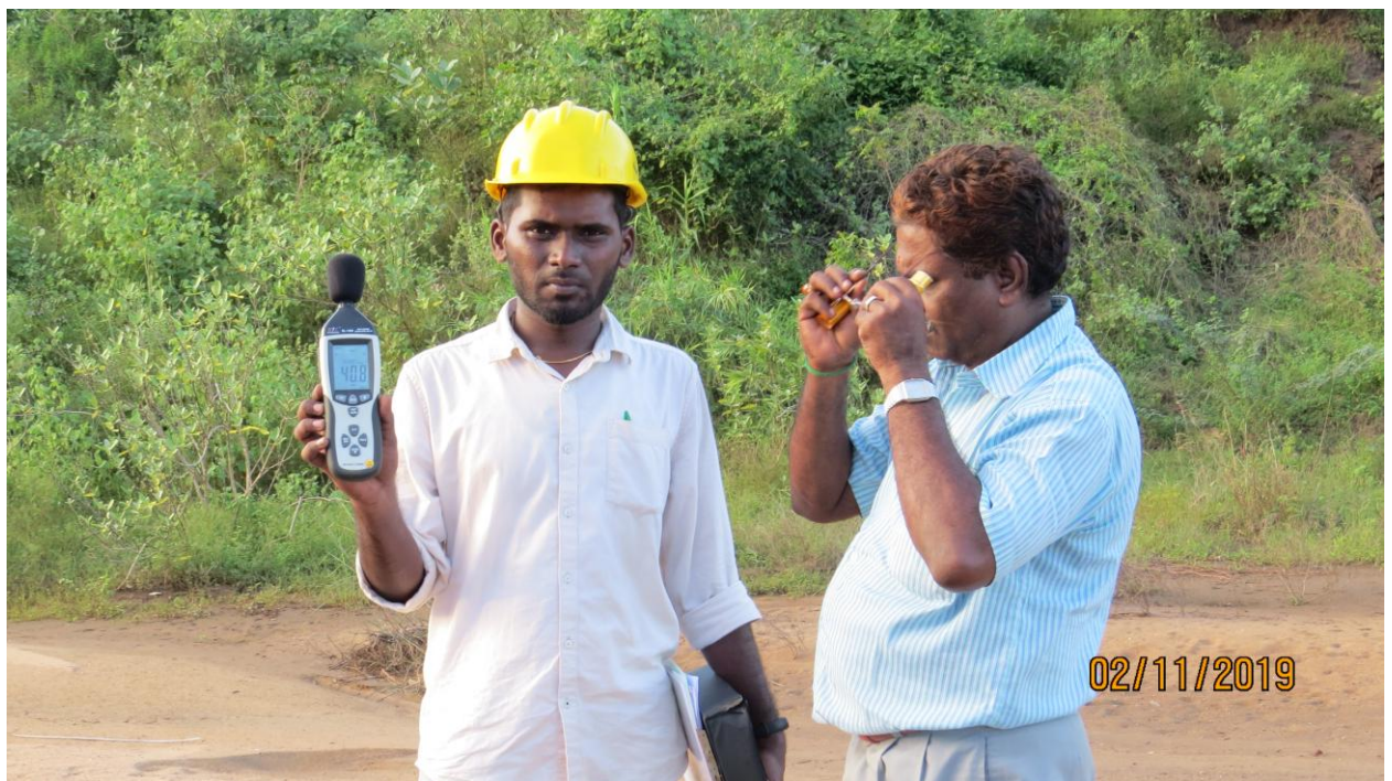
Fig: No: 4: Measuring Noise Level

Major noise generating sources may be considered as excavation, drilling blasting, loading and vehicle movement during transportation of minerals. With the starting of quarrying operations, it is imperative that noise levels shall increase. In order to assess the impact baseline ambient noise level, noise monitoring has been carried out at different points using Sound level meter