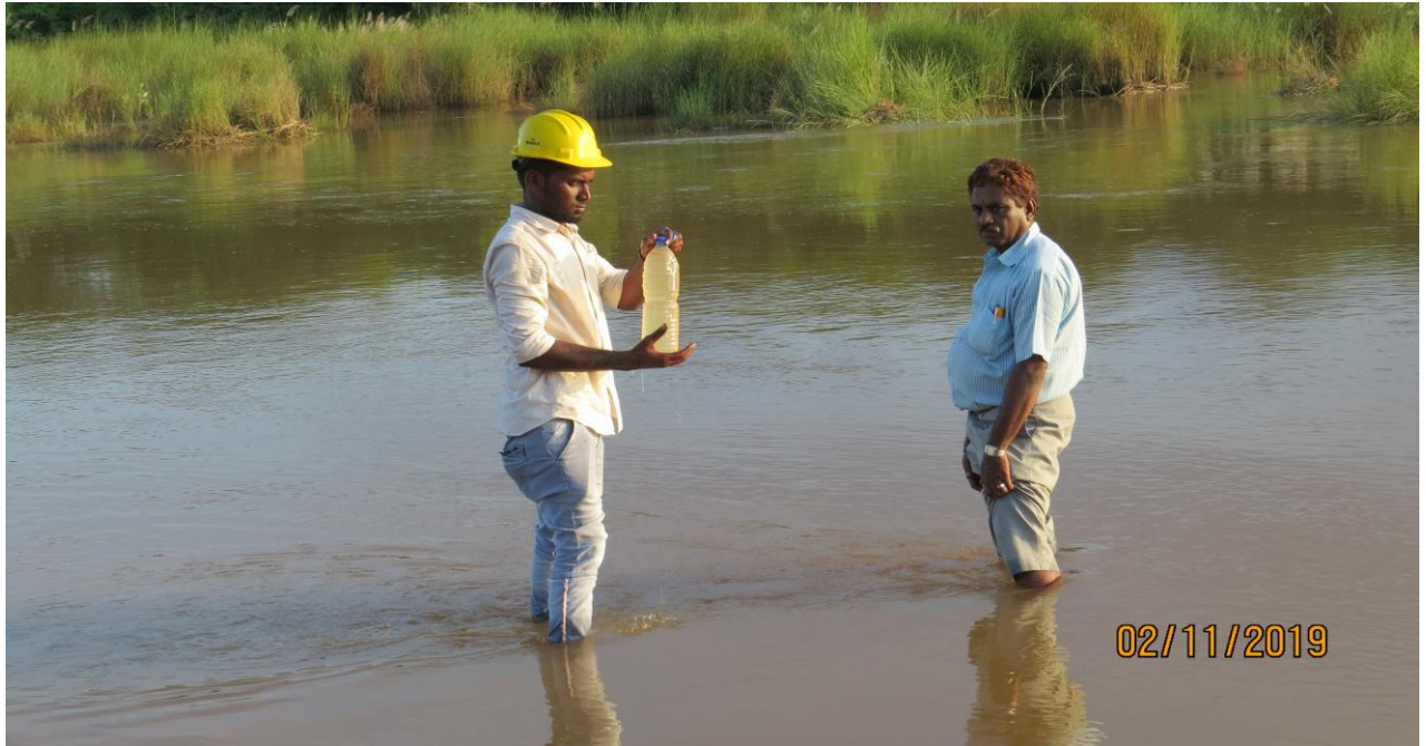
Fig: No: 3: Collection of Water sample