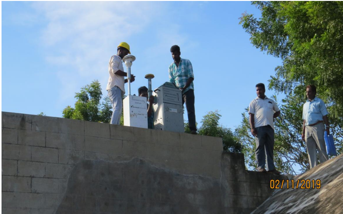
Fig: No: 5: Ambient Air monitoring

The major part of the dust generated during such operations usually gets settle down and thus the effect of such operation will be localized phenomenon.