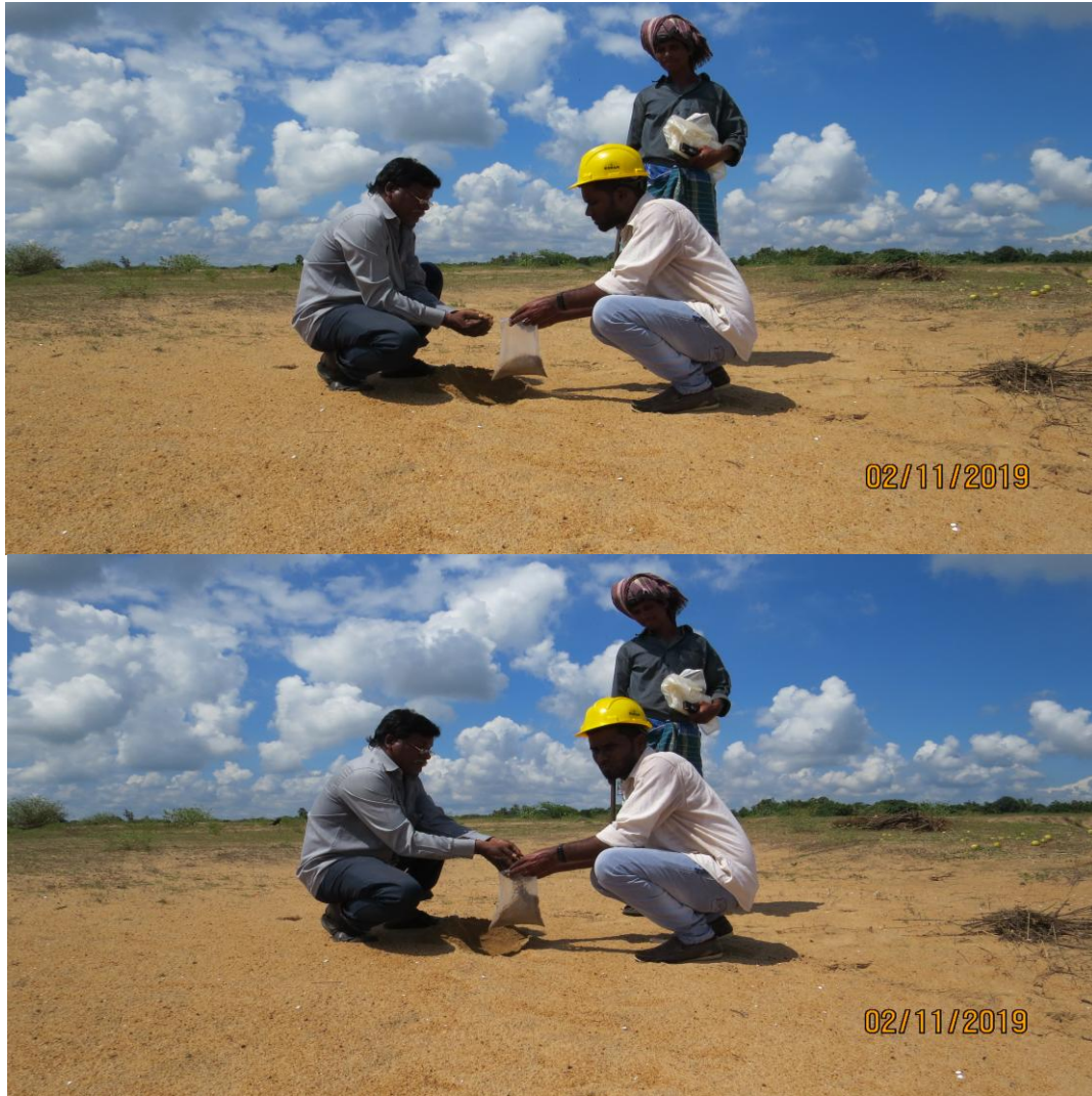
Fig No.2 Collection soil sample