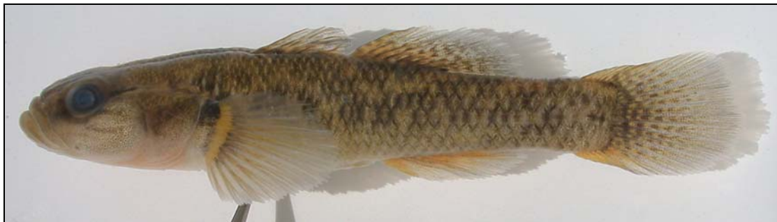
Figure 7. Ratsirakia legendrei collected with a hand net and mask and snorkel in the Nosivolo River at Marolambo.

Ratsirakia legendrei (Pellegrin 1919) (common name = Soboeta, Soadiboka, Atohobolitika) was collected in several Nosivolo and tributary sites. It was observed amongst rocks and sand in faster flowing areas of both large rivers and small streams. The eleotrids rest on and forage in the substrate and avoid the fast flows by being in the 'dead-water zone' close to the substrate. This record appears to be a southerly extension of the species' known distribution and so comparisons with material from other populations should be made to accurately determine the specific status of Nosivolo Ratsirakia specimens.