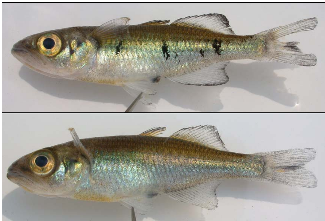
Figure 5. A male (upper) and female (lower) Rheocles wrightae from the upper Sahanao stream near Lavajiro Village, collected with at throw net.

Pers. com. Dr Melanie Stiassny). These were usually collected together with Bedotia sp. 'Nosivolo' although were usually less numerous than Bedotia . Two size classes were usually present – a large adult class (approximately 100-120mm TL), which was rare and juveniles of 20-30mm TL, which were presumably last year's recruits. This species was described from the Sandrangato River, south of Moramanga. If this is a correct identification then these Nosivolo records will probably result in a down-grading of its IUCN status due to a considerable increase in its known geographical range and population size.