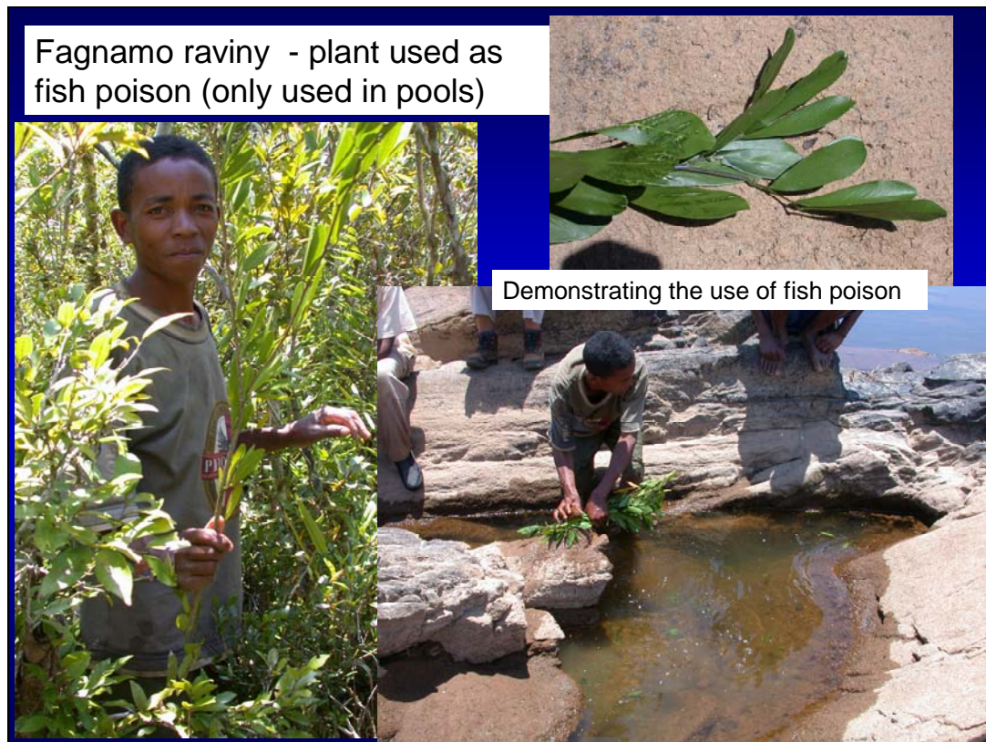
Figure 2. Plant used for poisoning still waters around the Marolambo region.

6.10. Riparian vegetation conservation. Erosion is one of the two major impacts in the system. In many instances cultivation goes to the waters edge. Local communities seem to recognise this is a poor policy and have stated they want to stop this. This is a very positive step and should be built upon immediately by DW and local authorities. All farmers need to leave strips of natural vegetation along river all river courses (both banks) as a permanent measure. It is probably best to get the advice of experts in erosion control to determine the extent of the strips although this is probably dependent on the topography of the river banks and thus variable. This is an urgent issue and it needs to be addressed on a catchment-wide scale.