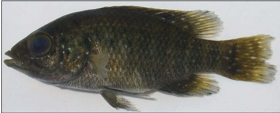
Figure 6. A juvenile Paratilapia bleekeri from an isolated pool (M5) on the Nosivolo River near Marolambo, collected with rotenone.

Eleotris pellegrini Mauge 1984 (common name = Soboeta, Soadiboka, Atohobolitika) was reported in previous reports on the Nosivolo River. Our November collections did not produce any specimens but we did collect another eleotrid Ratsirakia legendrei . At this stage I am unsure if this is simply a case of misidentification or if both species are present within the system. From my own experience of other Eleotris species within southern Africa Eleotris usually occurs lower down in systems so I would not predict its occurrence in the Nosivolo or upper Mangoro catchments.