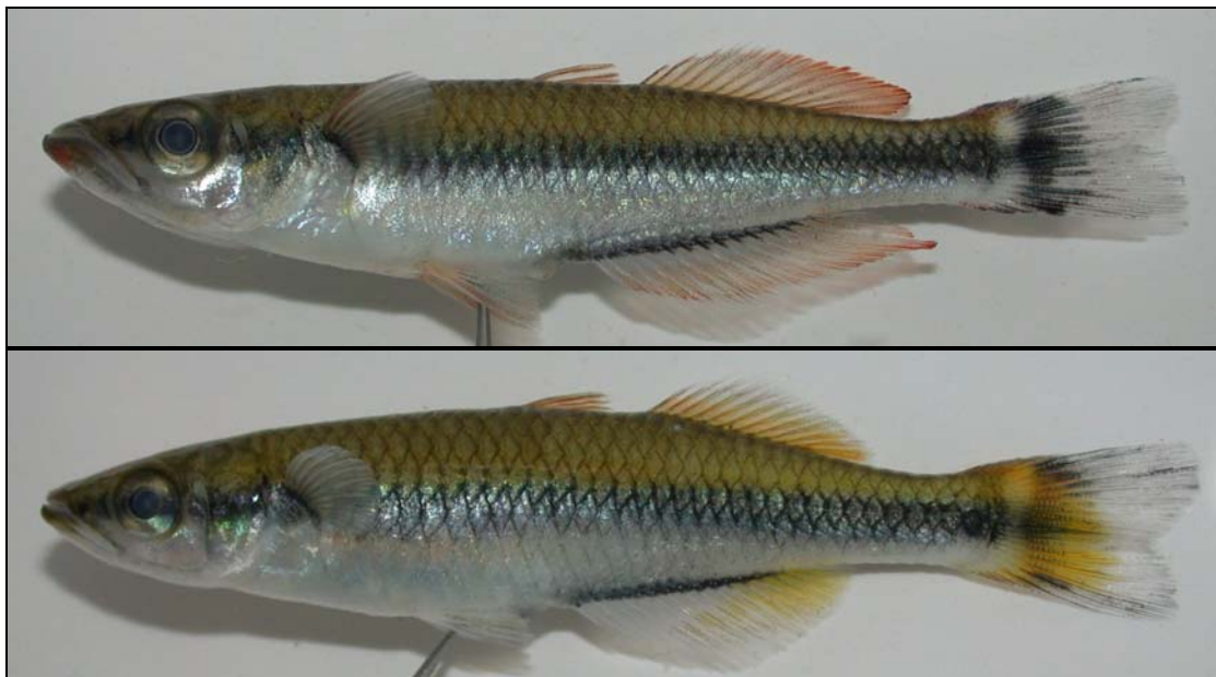
Figure 4. A male (upper) and female (lower) Bedotia sp. 'Nosivolo' from the Sandranamby River just upstream of Betampona village near Marolambo, collected with a hand net, mask and snorkel

Bedotia sp. 'Nosivolo' (common name = Vily, Zono) (IUCN status: VU: B1ab(i,ii,iii)+2ab(i,ii,iii)). An undescribed species widely distributed in waters around Marolambo in both the mainstream Nosivolo through to very small streams. Sexual dichromatism with male fins becoming more red and with a red to the lower jaw, females more yellow colouration in the bases of the fins. Usually found in quiet waters at the edges of rapids and falls, appear to move up streams during the spring possibly to spawn. According to work by Stiassny and Sparks most of the bedotids feed on drift material originating from the terrestrial environment. As such they may be less affected by sedimentation than species reliant on foraging in the substrate such as catfishes, eleotrids and gobies.