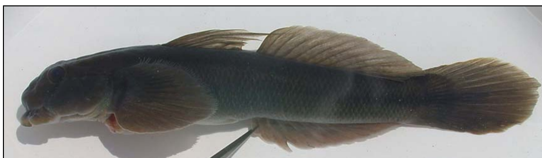
Figure 8. A male Sicyopterus franouxi from the Nosivolo River upstream of Marolambo, collected with at throw net.

Sicyopterus franouxi (Pellegrin 1935) (common name = Filelabato) was found in rapids at all sites within the main Nosivolo River and larger tributary (Sahanao River). It occurs in fast sections of rapids where it adheres to rocks with the pelvic sucker-disc. Large adult males were dark in colour with sometimes a broad lateral band, females were lighter in colour with indistinct vertical barring while juveniles have two horizontal bands on the body (Sparks & Nelson 2004). Fish were caught using a mask and snorkel in combination with a throw net.