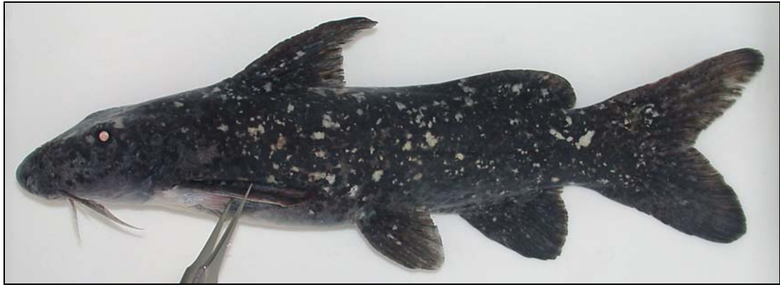
Figure 3. Gogo ornatus collected by gill netting in the Nosivolo River at Marolambo.

Bedotia sp. 'Nosivolo' (common name = Vily, Zono) (IUCN status: VU: B1ab(i,ii,iii)+2ab(i,ii,iii)). An undescribed species widely distributed in waters around Marolambo in both the mainstream Nosivolo through to very small streams. Sexual dichromatism with male fins becoming more red and with a red to the lower jaw, females more yellow colouration in the bases of the fins. Usually found in quiet waters at the edges of rapids and falls, appear to move up streams during the spring possibly to spawn. According to work by Stiassny and Sparks most of the bedotids feed on drift material originating from the terrestrial environment. As such they may be less affected by sedimentation than species reliant on foraging in the substrate such as catfishes, eleotrids and gobies.