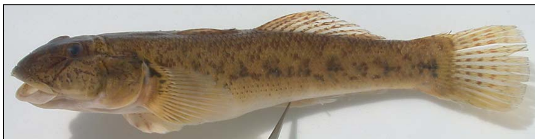
Figure 9. Awaous aeneofuscus from the Nosivolo River near Marolambo, collected with at throw net.

Awaous aeneofuscus Peters 1852 (common name = Atoho) was collected in Nosivolo River and tributary systems in varied habitats. It appears to be widespread although not very common in fishermen's catches. A photograph of A. aeneofuscus from the Durrell Wildlife/Conservation International files (Hpim0089.jpg) gives a new record size for this species of 340 mm TL.