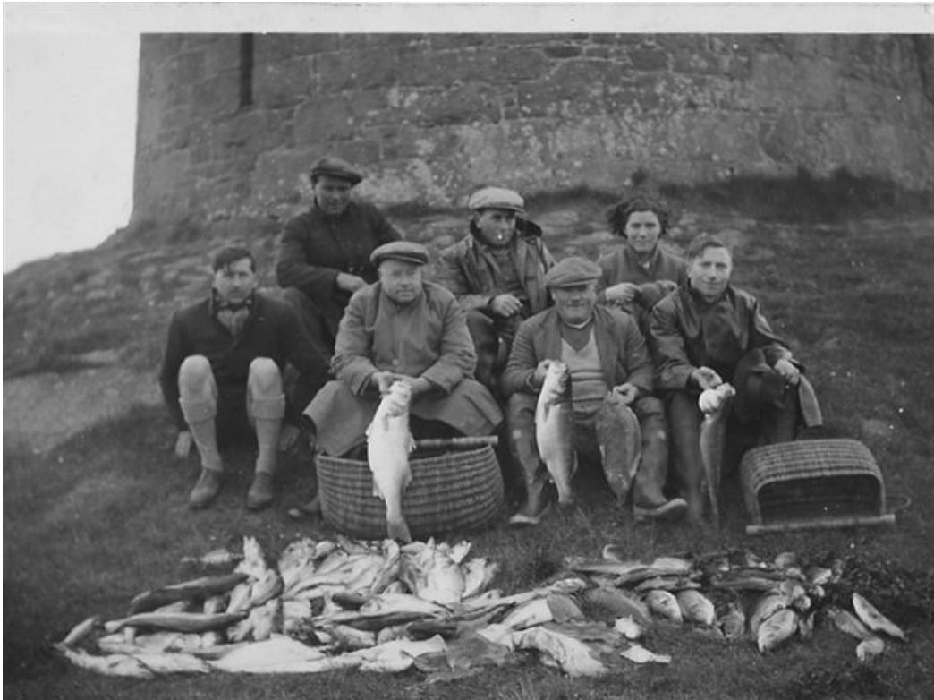
Catch from a day's fishing at Le Hocq circa 1934

There are several distinct facets that should be looked at when consideration is given to an assessment of economic value. There are clearly the extractive uses which have an economic value including commercial and recreational fishing and aquaculture. There are also other recreational pursuits that use the site but do not consume resources such as recreational and tourism activities such as boating, walking, wildlife watching, and the nature walks known locally as "moon walks". There are also a number of other activities that occur which are difficult to put a value on. Seaweed washed to the top of the beach is gathered by growers, both commercial and amateur, for application to arable land and gardens as a fertiliser and field dressing. Off-Island marketing of the famous Jersey Royal potato refers to the use of seaweed enhancing the flavour of very important crop. There is also the scenic value to residents who live adjacent to the site and it is of importance to those who simply value protecting a site and conserving natural resources for future generations. Whilst many of these values may be difficult to quantify there is an inherent value and therefore should be considered.