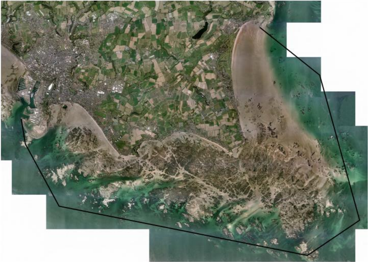
Figure 1. Extent of the South-East Coast Ramsar Site