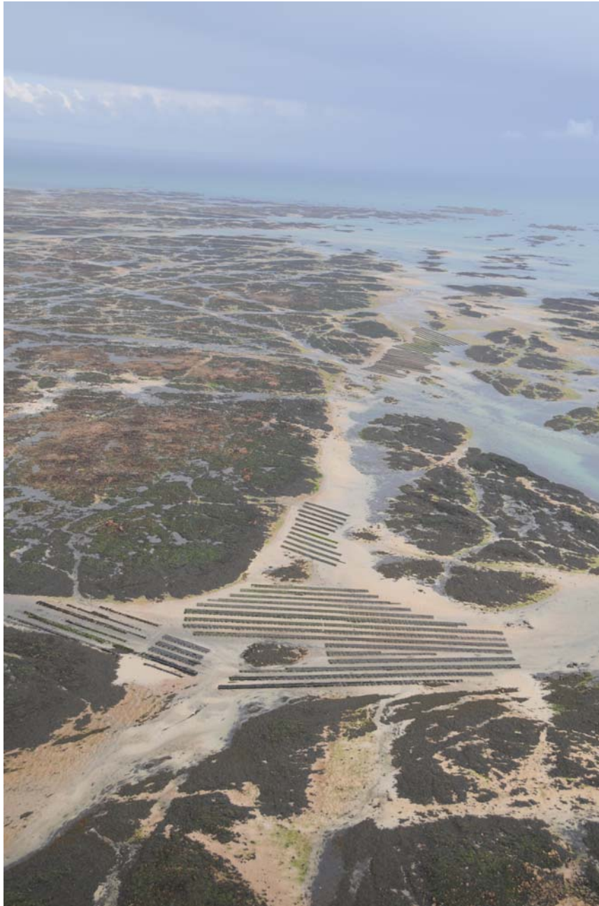
Matrix of Exposed Rock and Sandy Gullies -Part of the South east Coast Ramsar site

Limited jurisdiction remains an issue as many environmental impacts that affect or have the potential to effect arise from outside of the site and outside Jersey's territorial waters. An example of this would be some aspect of fisheries management, particularly management of pelagic fish stocks, where ultimate authority rests with the UK or EU.