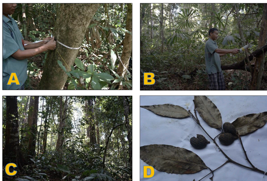
Fig. 2. Plot study carried out inside the Pala Wetland Reserve Forest, Mizoram A,B- Quadrat study; C- Forest area; D- Voucher specimen of Xerospermum noronhianum .