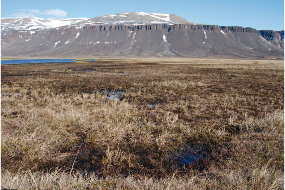
View over the upper Ørsted Dal study area seen from NW in mid June 2009. A part of Primula Pond is seen in the foreground, and breeding cliffs of Barnacle Geese on the southeast side of the valley are seen in the background.

Udsigt over undersøgelsesområdet i øvre Ørsted Dal set fra nordvest. En del af Primula Pond ses i forgrunden, og klipperne med ynglende Bramgæs ses i baggrunden.