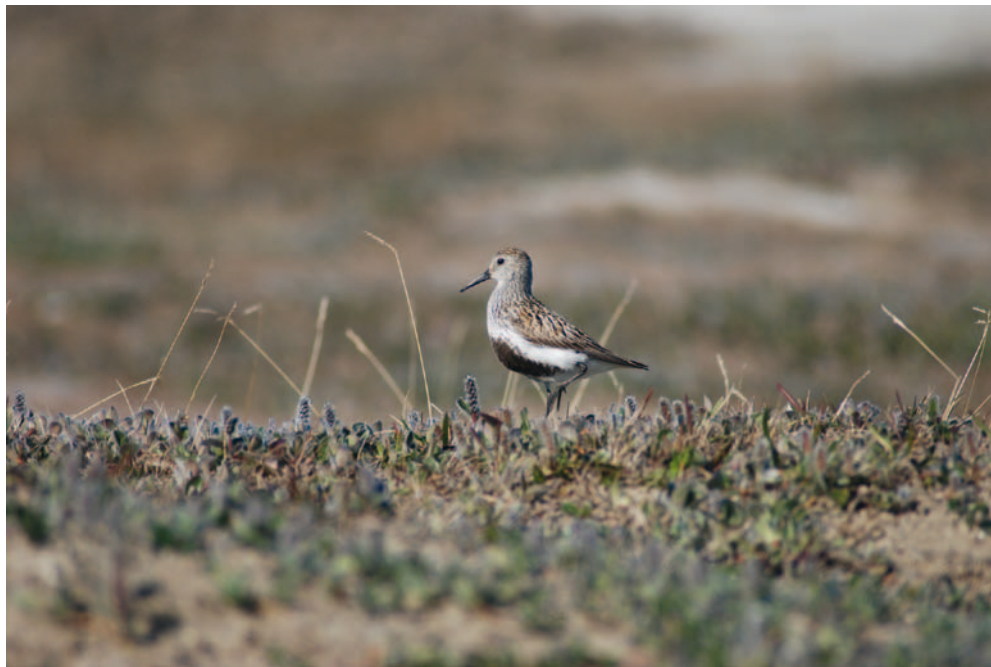
The high Arctic subspecies of Dunlin Calidris alpina arctica was a numerous wader breeding in Ørsted Dal.

Den højarktiske race af Almindelig Ryle Calidris alpina arctica, som er en talrigt ynglende vadefugl i Ørsted Dal.