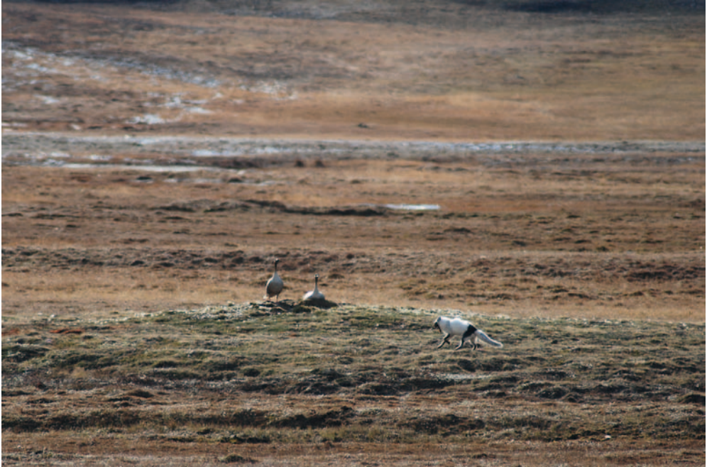
The Pink-footed Geese had a hard time defending themselves against the many arctic foxes in 2009.

De Kortnæbbede Gæs blev konstant angrebet af de mange polarræve i Ørsted Dal i 2009.