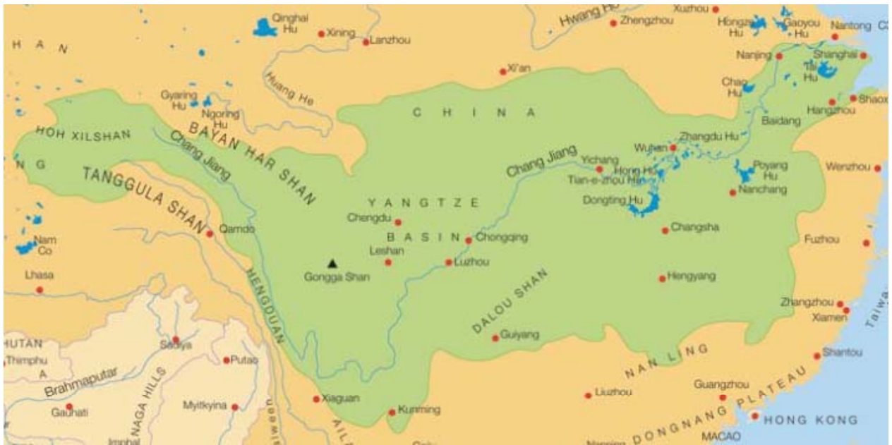
Location of the central floodplains wetlands downstream of Three Gorges Dam on the Yangtze River, China (WWF UK 2008, from Pittock and Xu 2010)