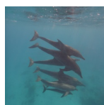
The Rough-toothed dolphin ( Steno bredanensis) uses the site for refuge, birthing and nursery.