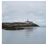
Bird colony at one of the islands in the archipelago

Please provide at least one photograph of the site: