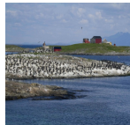
Bird colony at one of the islands in the archipelago